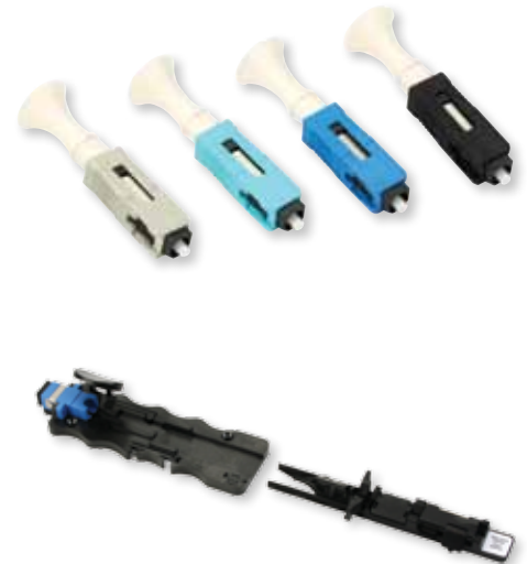
3M™ No Polish SC Connector Assembly Tool 8865-AT