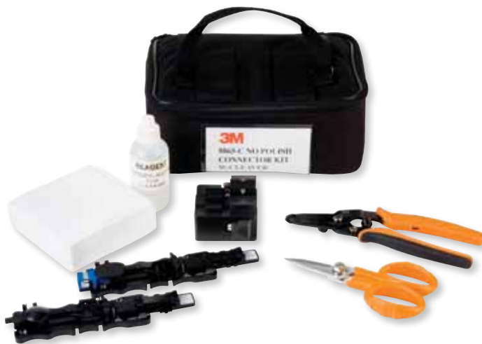
3M™ No Polish Connector Kit with Cleaver 8865-C

The No Polish Connector is RoHS Compliant.