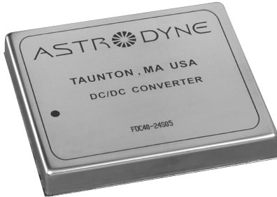
Unit measures 2.0"W x 2.0"L x 0.4"H