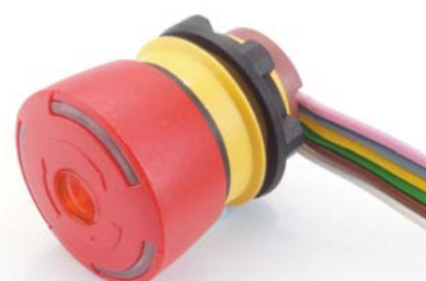
Emergency-stop red LED illuminated, ribbon cable, twist release, 32mm diameter for 22.5mm mounting, foolproof to EN 60947-5-5