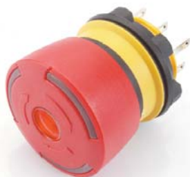
Emergency-stop red LED illuminated, plug-in terminals, twist release, 32mm diameter for 22.5mm mounting, foolproof to EN 60947-5-5