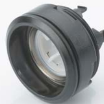
Pushbutton actuator for flush mount, black plastic, IP67 front protection, 22.5mm mounting