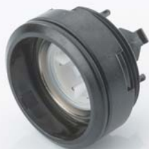
Indicator body for flush mount, black plastic, IP67 front protection, 22.5mm mounting