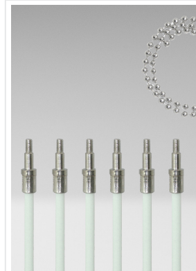
RDG-30 - 30' Glow Rod