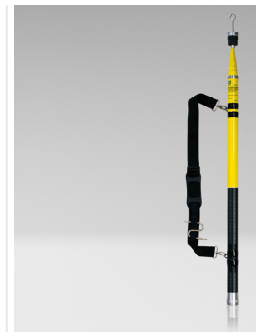
RDT-18 - Telescoping