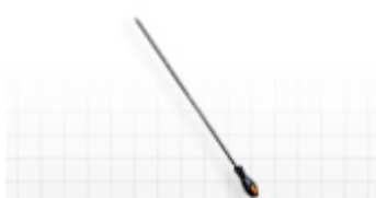
24 Inch Long #3 Phillips Head Screwdriver - SD-243