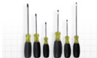
Slotted and Phillips Head Screwdrivers