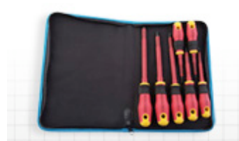
7 Piece Insulated Screw Driver Set - TK-70INS