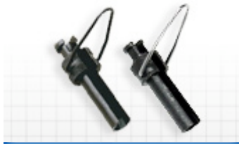
Security Shield Tool