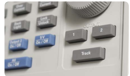
Figure 3. Simplifies Output 1 and Output 2 setup with tracking feature