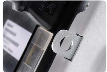
Physical lock mechanism as illustrated

Essential security features: Over-voltage protection (OVP)/ Over-current protection (OCP), keypad lock and physical lock mechanism