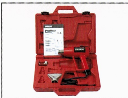
PH-2100K Professional Kit with 2 versatile attachments