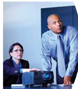
Back Projection Display Systems