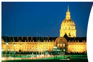
Street and Monument Lighting