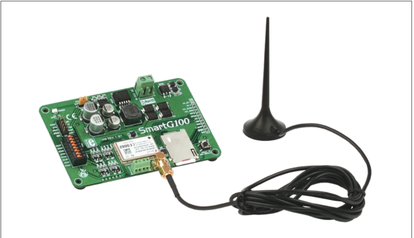
Figure 1: SmartG100 with uBlox Leon-G100 module