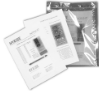
GMR Switch Digital Evaluation Kits Parts List

These kits were created to facilitate laboratory experimentation and development using NVE's GMR Switch Digital Output Sensors. The kits consist of sixteen distinct NVE GMR Switches that span the magnetic field range and output types available in the AD-Series sensors. All sensors in this kit are packaged in the MSOP8 miniature surface mount package. The kits also include a ceramic bar magnet and printed circuit boards (PCBs) for testing in the actual application. In addition, the AG910-07 kit includes a high temperature (175°C) MSOP8 ZIF socket with Kelvin contacts.