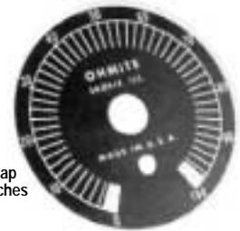
For tap switches