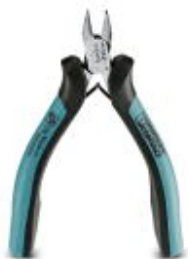
Electronic diagonal cutter, tapered head, angled (21°), without chamfer, with opening spring

Please be informed that the data shown in this PDF Document is generated from our Online Catalog. Please find the complete data in the user's documentation. Our General Terms of Use for Downloads are valid ( http://phoenixcontact.com/download )