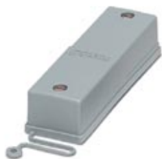
VARIOCON protective cover for the supporting base element and panel mounting frame, degree of protection: IP50, type: 4

Please be informed that the data shown in this PDF Document is generated from our Online Catalog. Please find the complete data in the user's documentation. Our General Terms of Use for Downloads are valid ( http://phoenixcontact.com/download )