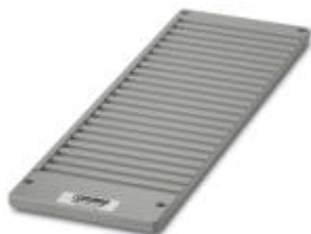
Plastic magazine for CMS-P1 plotter. Accepts 22 contactor label zack marker strips

Please be informed that the data shown in this PDF Document is generated from our Online Catalog. Please find the complete data in the user's documentation. Our General Terms of Use for Downloads are valid ( http://phoenixcontact.com/download )