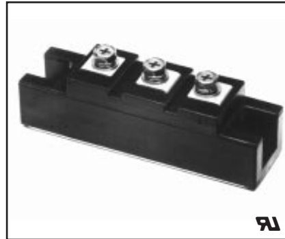
CD410830 Dual Diode POW-R-BLOK™ Modules 30 Amperes/800 Volts