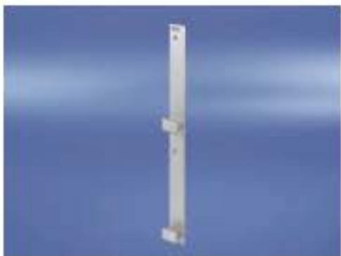
Illustration shows plug-in unit, 6 U, 4 HP