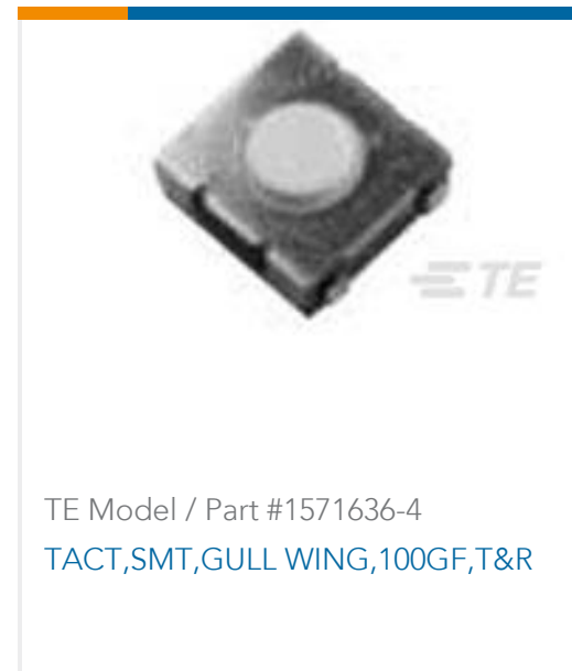
TE Model / Part #1571636-4 TACT,SMT,GULL WING,100GF,T&R