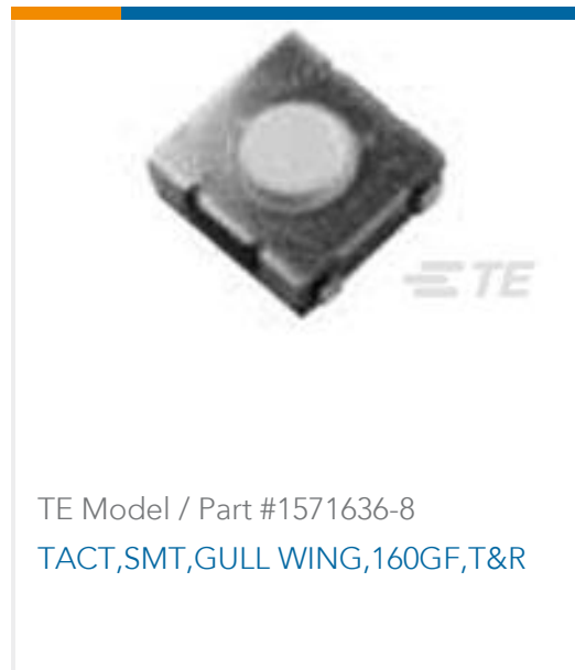
TE Model / Part #1571636-8 TACT,SMT,GULL WING,160GF,T&R