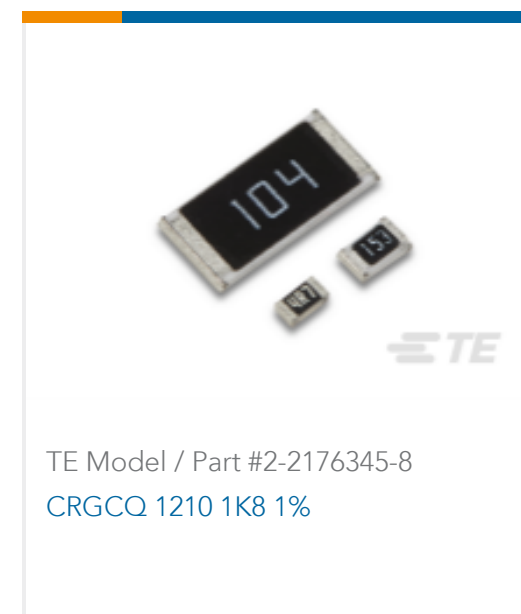
TE Model / Part #2-2176345-8 CRGCQ 1210 1K8 1%