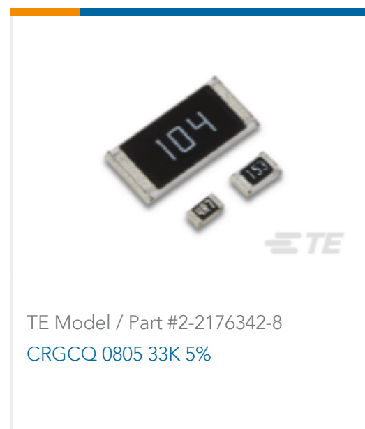
TE Model / Part #2-2176342-8 CRGCQ 0805 33K 5%