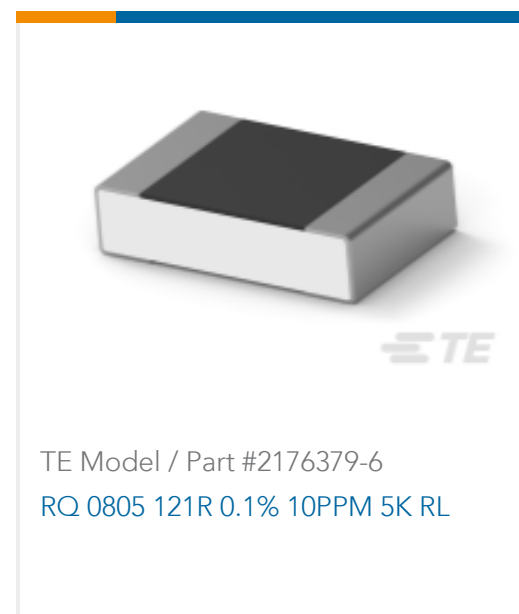
TE Model / Part #2176379-6 RQ 0805 121R 0.1% 10PPM 5K RL