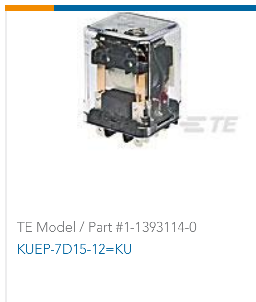
TE Model / Part #1-1393114-0 KUEP-7D15-12=KU