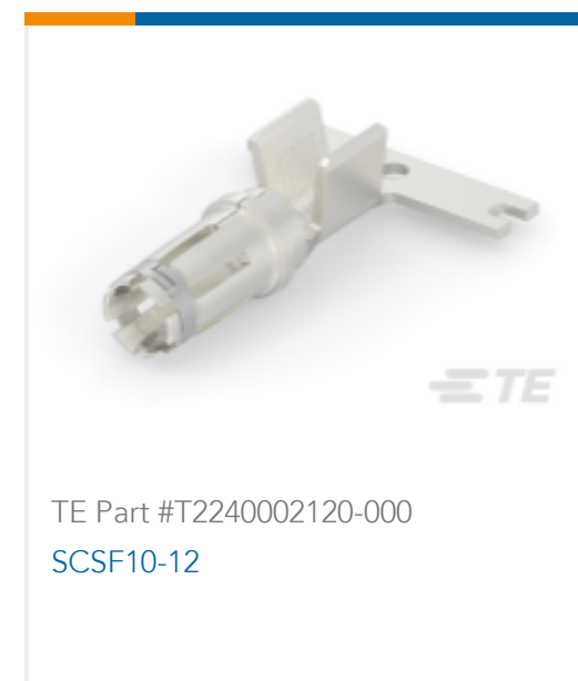
TE Part #T2240002120-000 SCSF10-12