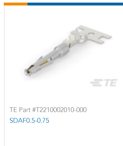
TE Part #T2210002010-000 SDAF0.5-0.75