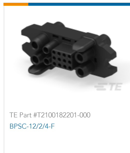
TE Part #T2100182201-000 BPS-12/2/4-F