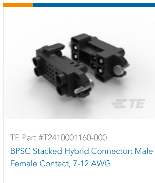
TE Part #T2410001160-000 BPS Stacked Hybrid Connector: Male Female Contact, 7-12 AWG