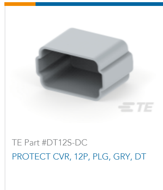
TE Part #DT12S-DC PROTECT CVR, 12P, PLG, GRY, DT