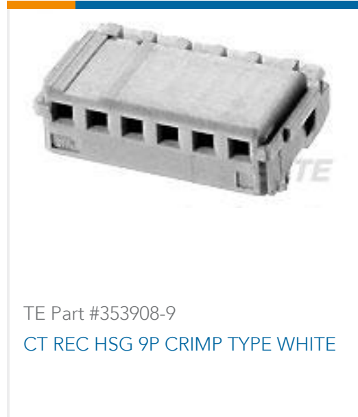
TE Part #353908-9 CT REC HSG 9P CRIMP TYPE WHITE