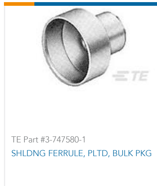
TE Part #3-747580-1 SHLDNG FERRULE, PLTD, BULK PKG