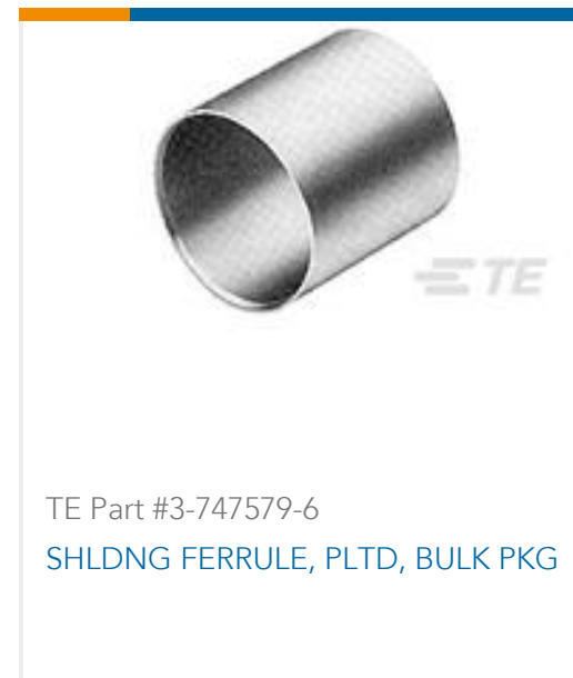
TE Part #3-747579-6 SHLDNG FERRULE, PLTD, BULK PKG