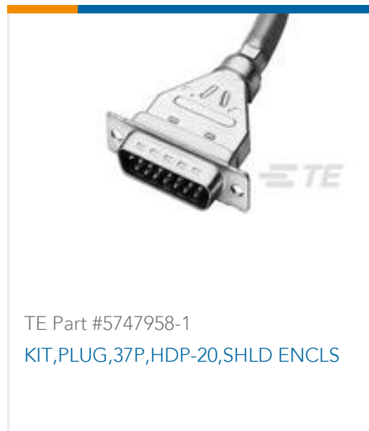
TE Part #5747958-1 KIT, PLUG, 37P, HDP-20, SHLD ENCLS