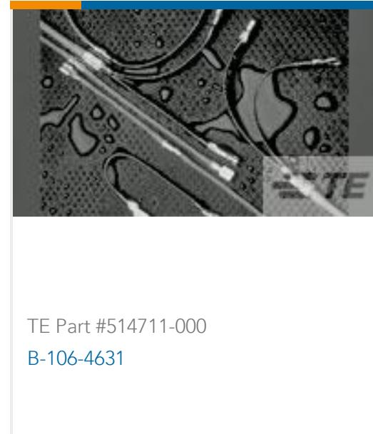
TE Part #514711-000 B-106-4631