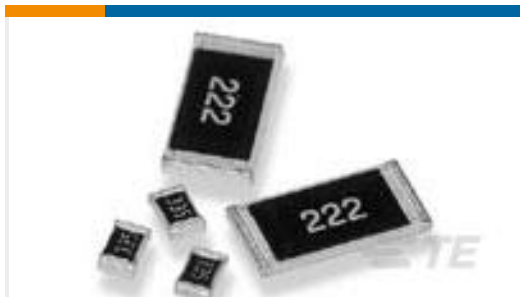
TE Part #4-1879495-6 CRGH0603 5% 1M0 0.2W