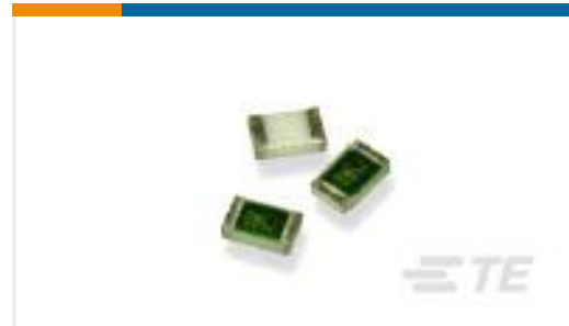
TE Part #9-1879337-4 CPF 0603 23K2 1% 50PPM 1K RL