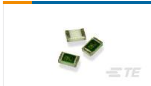
TE Part #9-1879208-8 CPF0402 130K 0.1% 25PPM 5K RL