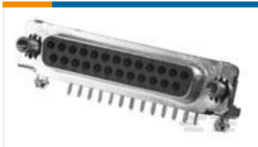
TE Part #747846-6 25 MSFL RCPT RA 318 (SL,FM,BL)