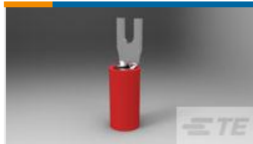
TE Part #8-328394-1 PIDG SPD 22-16COMM 22-18MIL 2