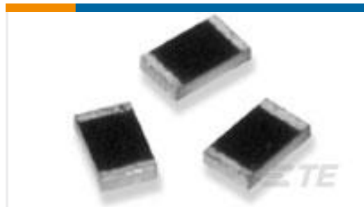
TE Part #1625867-8 RP 1J 0.166W 68K1 0.1% 25PPM 1K RL