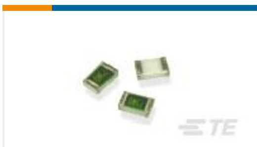
TE Part #2-1676970-5 RN 0603 182R 0.1% 10PPM 1K RL