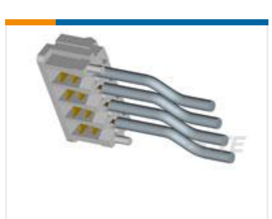
TE Part #173977-4 CT CONN MT REC ASSY 4P