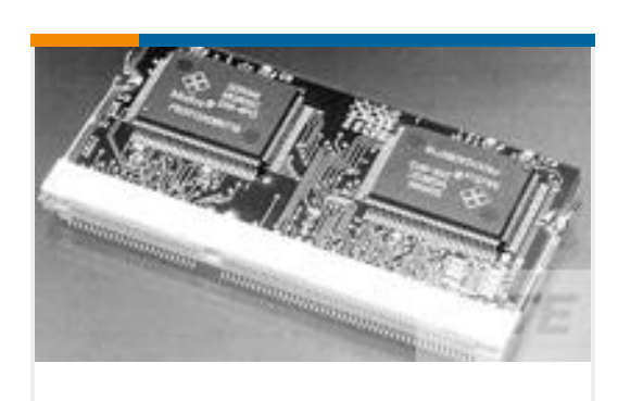
TE Part #390112-1 SKT,SODIMM,144P,SDRAM3.3V,HIGH