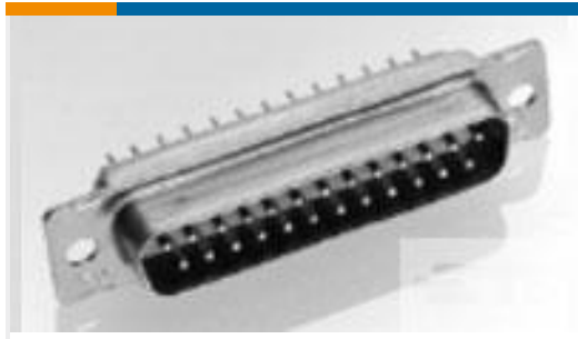
TE Part #205557-2 RECEPT ASSY,15 POSN,AMPLIMITE